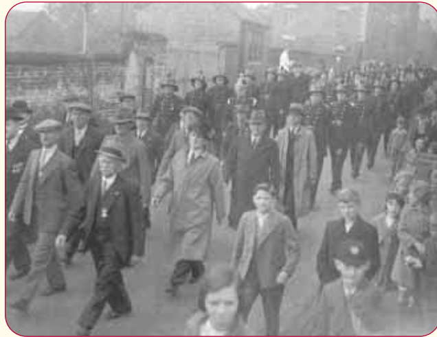
Armistice Day Parade York Street mid 1930's