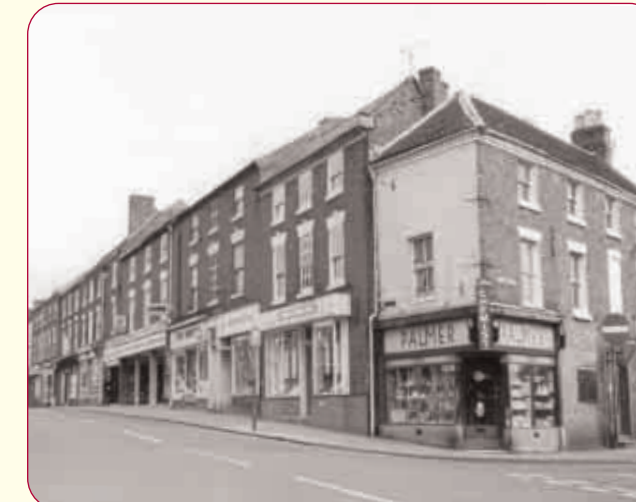
An early picture of the corner of York Street and the High Street from the T.Baylis Photograph Collection, Stourport Library.