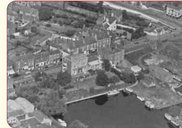
York Street Basins taken late 1950's